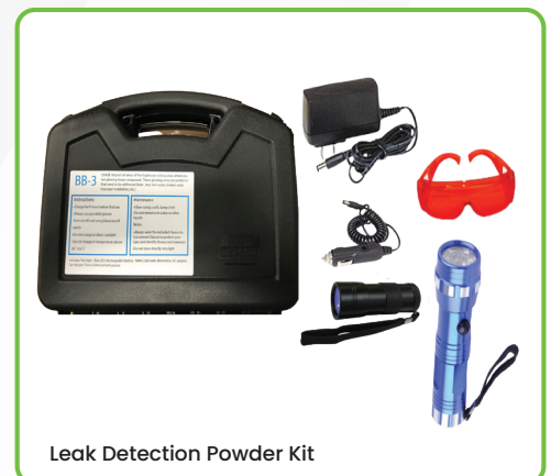
Leak Detection Powder Kit